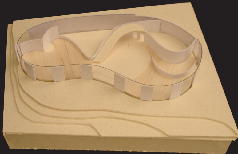
photo: work model, ground floor

In this area we could choose between three building sites, to create a library of about thousand quare meters.