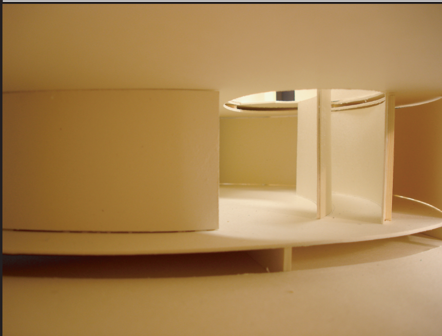
photo: third floor, opening for stairs to the fourth floor

The construction will be of wood. The vertical girder are visible from the outside like the model is shown. The horizontal architraves are also visible from the inside, and between the load bearing girders there will be a ceiling of wood.